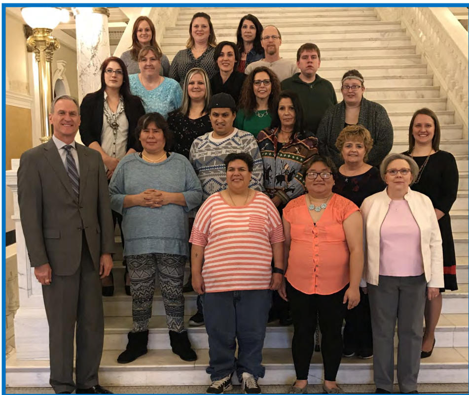
Partners in Policymaking Year 26 with Governor Dennis Daugaard

You see an older man, alone, going into a children's movie at the theatre. You wonder why he is there if he does not have a child with him. You may begin to make some assumptions. What you do not know is the man has an intellectual impairment and prefers the children's movies to the other selections which may feature violence or horror.